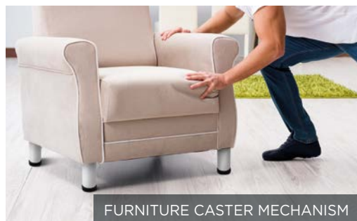
FURNITURE CASTER MECHANISM

Intuitively simple "Stop & Go" mechanism