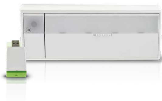
TELE MASTER - BATTERY OPERATED EMERGENCY LIGHTING