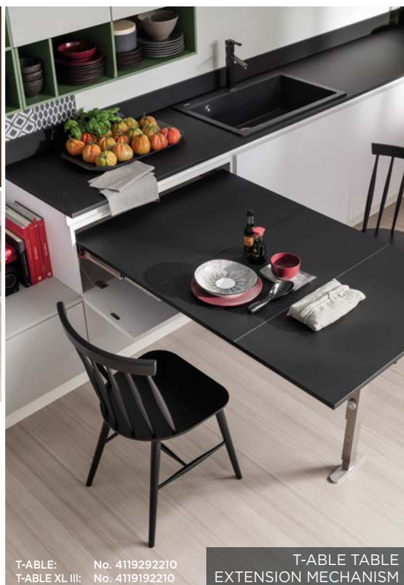
T-ABLE: No. 4119292210 T-ABLE XL III: No. 4119192210

Installed in a drawer space, behind a hinged drawer front that tips out to let the table slide out of the cabinet.