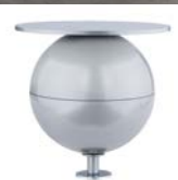
ROTATING TABLE MECHANISM