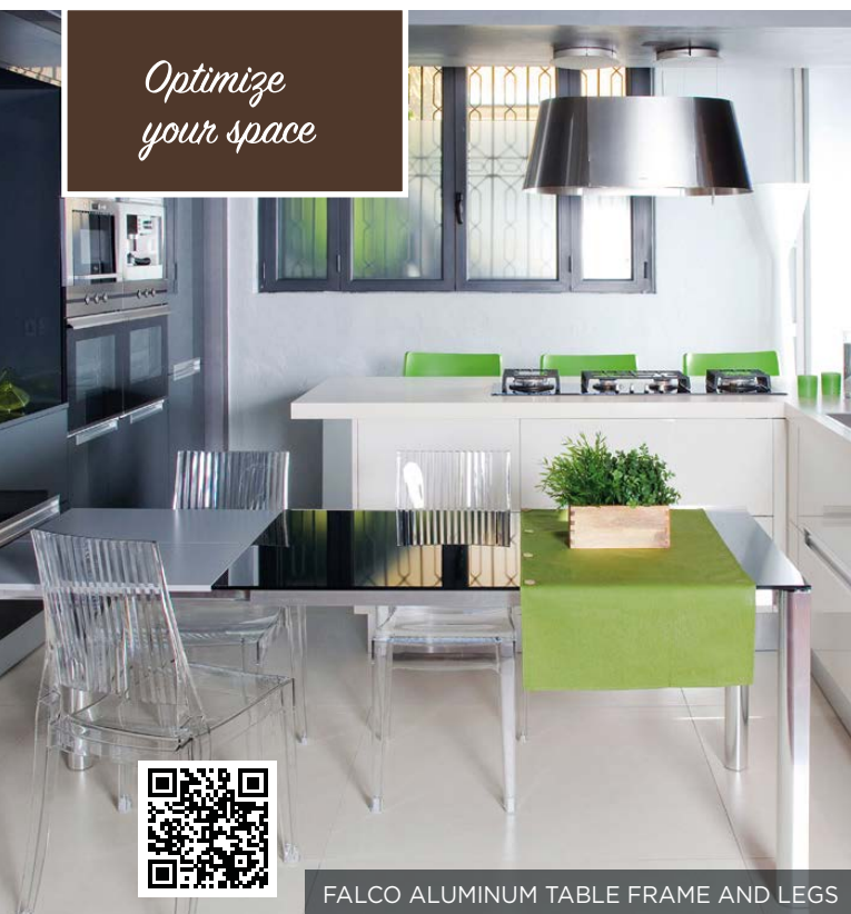
FALCO ALUMINUM TABLE FRAME AND LEGS

Rectangular table available in three different configurations to meet your space requirements.