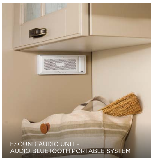
ESOUND AUDIO UNIT - AUDIO BLUETOOTH PORTABLE SYSTEM