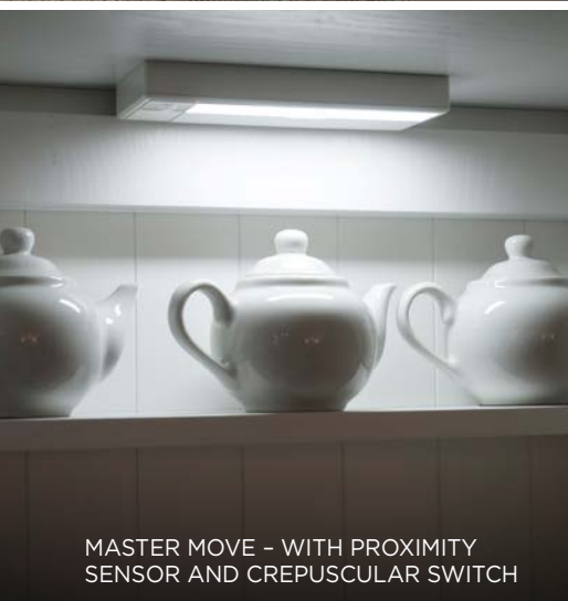
MASTER MOVE - WITH PROXIMITY SENSOR AND CREPUSCULAR SWITCH