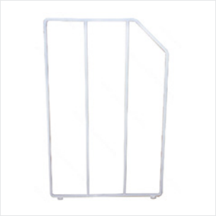
Tray Divider 1001830 (white), 0018140 (chrome)