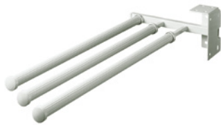
A Pull-Out Towel Rack 314330