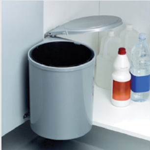
Plastic Waste Bin 13 l T2700100 (gray)