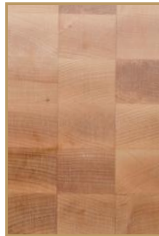
WITHOUT MYSTERY OIL APPLIED