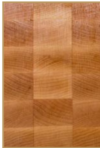
WITH MYSTERY OIL APPLIED

For additional protection, Boos Block® Board Cream should be applied as a secondary moisture barrier in between oil applications. Simply apply and even coat and wipe off the excess for maximum protection.