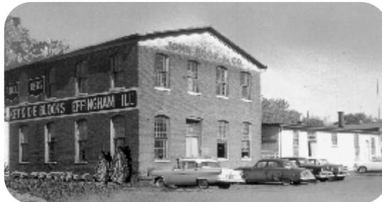
JOHN BOOS & CO. WOOD MANUFACTURING FACILITY EFFINGHAM, IL