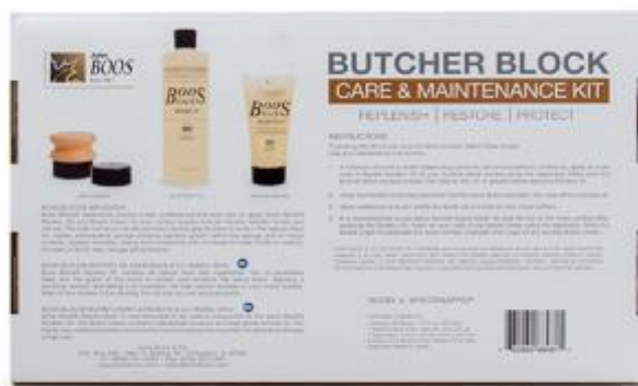
MYSCRMAPPGP (GIFT PACK)