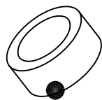
washer \phi 12 * \phi 10.8 * 4.5