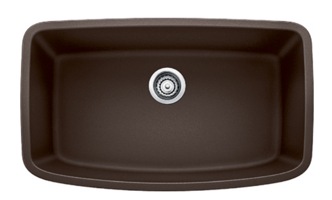
Model 441613 shown