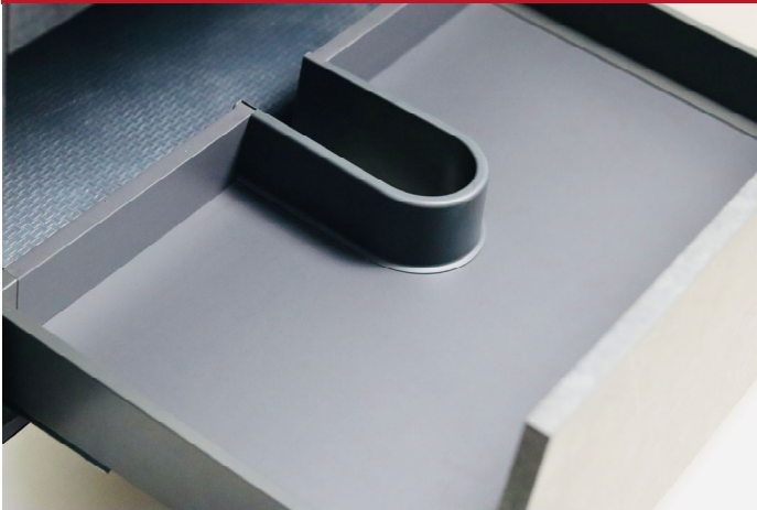
Dark grey finish shown