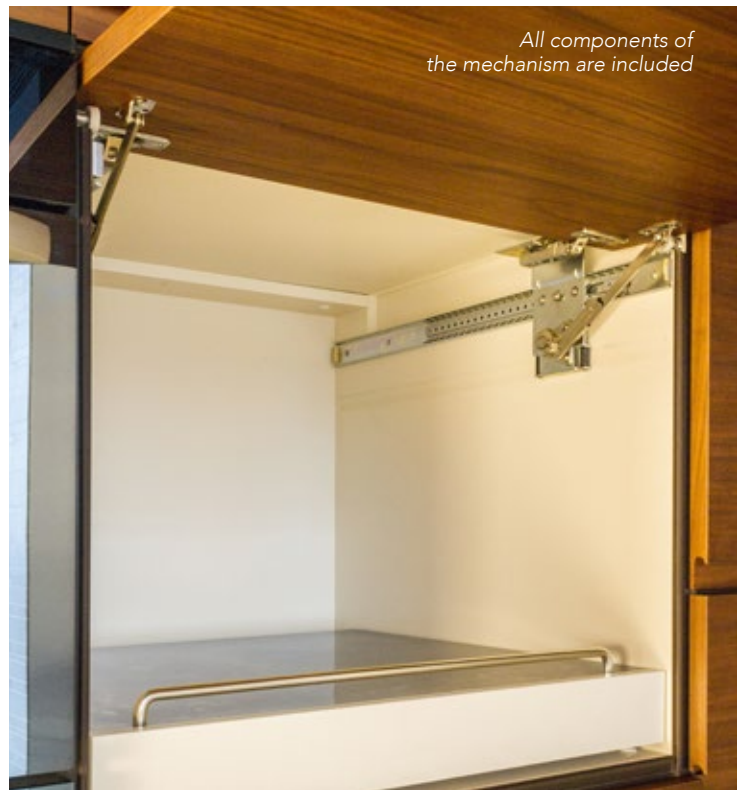
All components of the mechanism are included

Torque(kg*cm) = door height (cm) x 0.5 x door weight (kg)