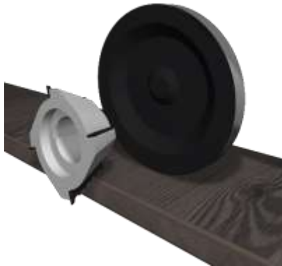
Fig. 3 – Milling bit –