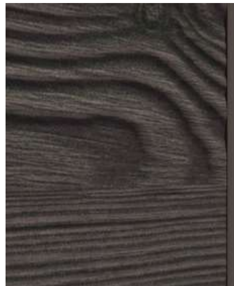
Fig. 2 – Edge protrusion –