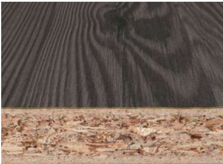
Fig. 1 – Texture geometry –

The texture geometry (ref. Figure 1) features alternating raised areas and depressions. The finishing units must be adjusted to the raised areas (texture elevations) to prevent damaging the surface of the board material. Due to this adjustment, as well as the texture-related alternation between "mountain and valley", there is an edge protrusion in the "valley" of the texture (ref. Figure 2) This protrusion in most cases is saturated with adhesive due to the edge location. Due to the process, this edge protrusion can't be avoided but adjustments can be made to reduce it. Proceed to remove as much adhesive as possible and round the edge slightly to reduce sharpness.