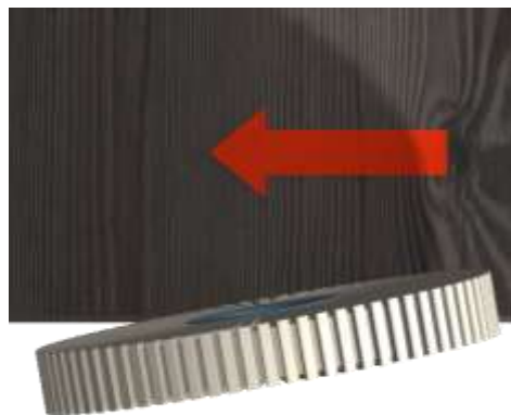
Fig. 8 – Approx. 10° outward –