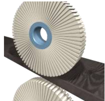
Fig. 5 – Cleaning brush –