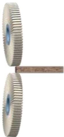
Fig. 7 – Tilted approx. 3° –

Edge protrusions in the area of the texture depressions lead to adhesive residue remaining on the protruding edge. Despite the use of release and cleaning agents, the use of cleaning brushes can brush the excess adhesive into the surface and/or leave it on the narrow surface of the edge. In this case, the application quantity of the adhesive, as well as the correct adjustment of the cleaning agent application should be checked. The application quantity of the release and cleaning agents must be selected so that the cleaning units are permanently moistened. Dry cleaning brushes tend to get warm and heat up the adhesive on the board surface, which in turn causes the adhesive to smear. Sisal brushes have proven themselves in use, a lower speed can be advantageous. The setting of the cleaning units must be selected so that the adhesive is removed thoroughly but the board surface is not damaged by polishing up the surface texture (ref. Figures 7,8,9).