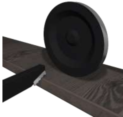
Fig. 4 – Draw blade –