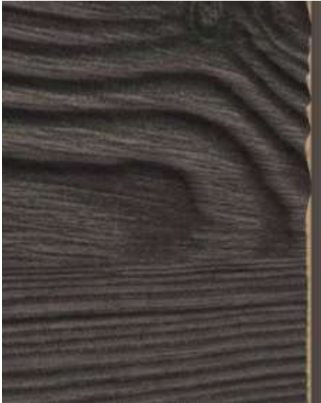
Fig. 6 – Damaged surface layer –