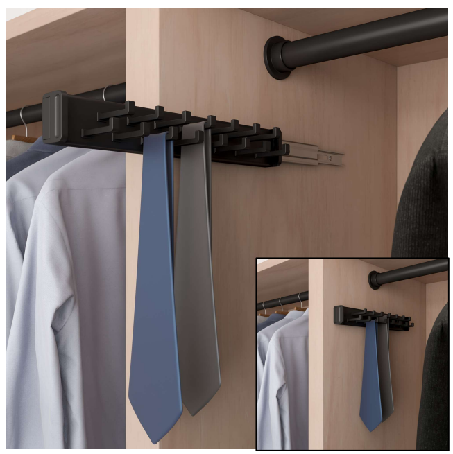
Belt Rack Tie Rack