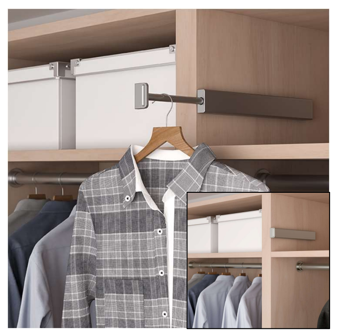
Scarf Rack Valet Rod