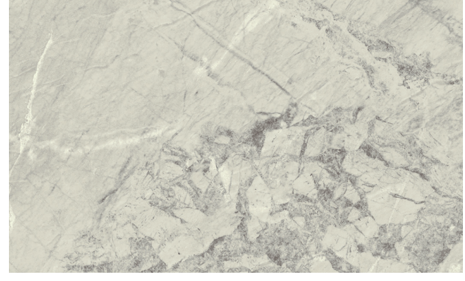
SERRANIA 1890K-22 is a warm, off-white Carrera marble design that has intricate and subtle veining in crisp whites and warm taupes.