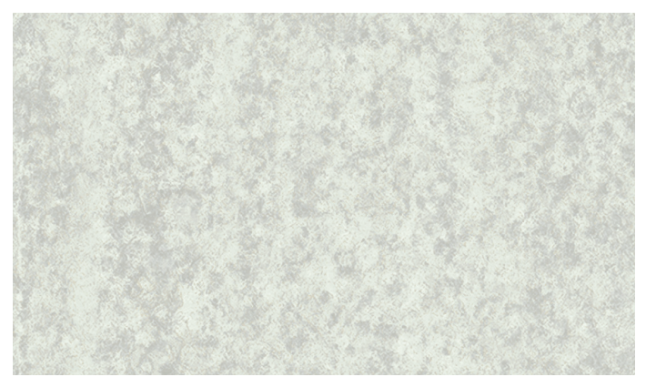
RIBBON MARBLE 1889K-07 is a delicate and feathery linear stone look reminiscent of a Crystal Wood Vein marble in cool white and grey tones.