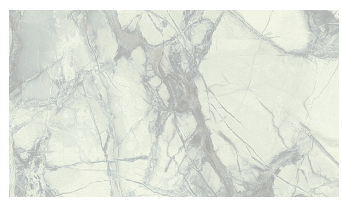
COTE D'AZUR 1886K-07 is a large-scale, white Cote d'Azur marble design with thick, cool fractures and thin, warm veining.