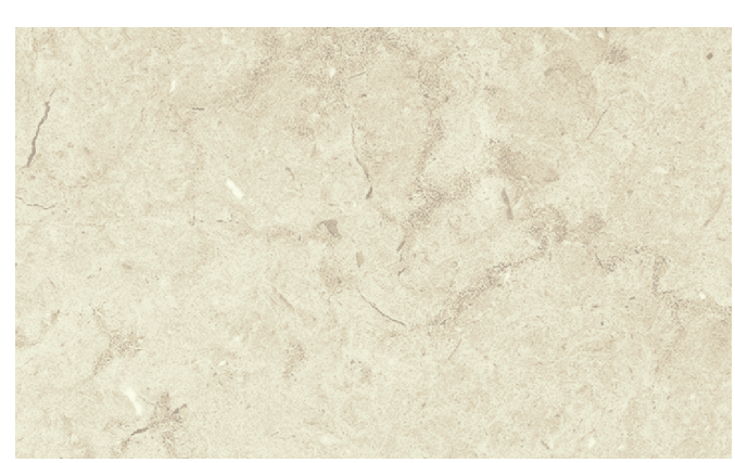
HEBRON WHITE 1888K-22 is a Jerusalem stone look that has soft, sophisticated movement and detail in a range of warm, cream tones.