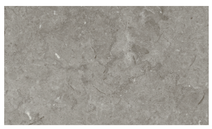
BENJAMIN GREY 1887K-22 is a Jerusalem stone look that has soft, sophisticated movement and detail in a range of grey tones.