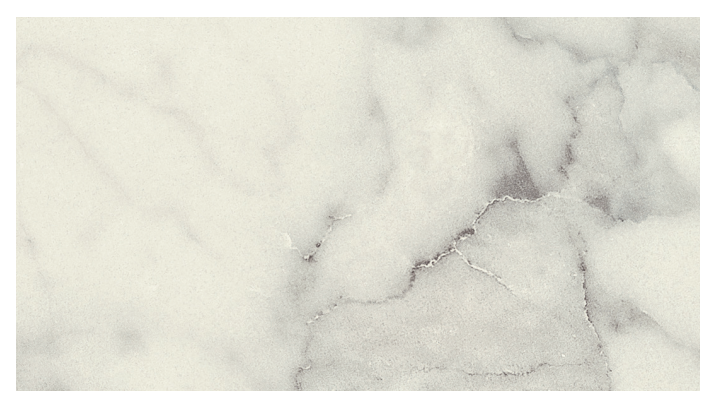
MARMO BIANCO 1885K-07 is a white Torano marble design with varying sizes of grey veining and hints of warm taupe, creating a chunky marble effect in shades of grey that display intricate depth and detail.