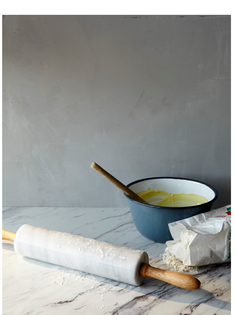
MERCURY VESTA 4988K-07