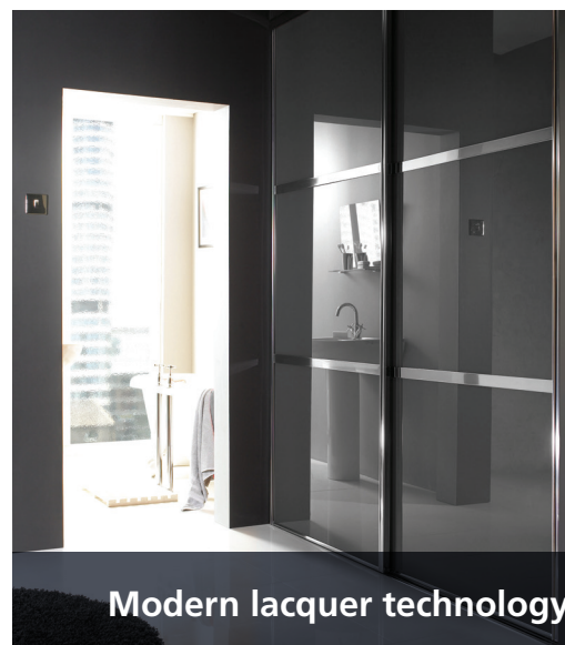
Modern lacquer technology