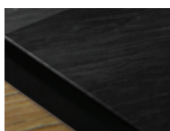
Onyx – R9000090