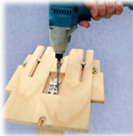
3) Screwing (B)