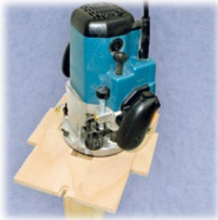
1) Route with routing-jig