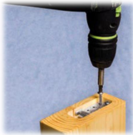
2) Screwing (A)