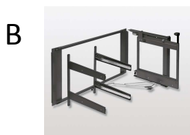
Right hand opening