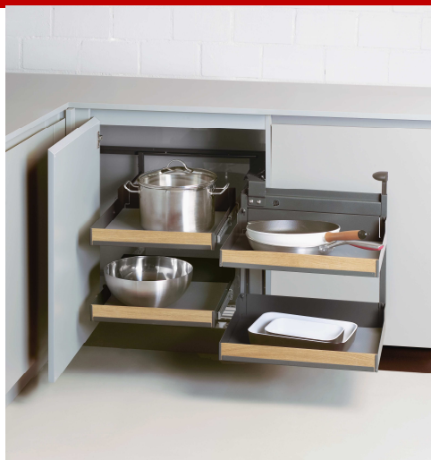
Right hand shown

Magic Corner II is the perfect solution for corner cabinets with hinged door. Not only does it transform the space available in your corner cabinet into functionality, but it gives you an immediate access to all items stored. Pull the front baskets out of the cabinet and the rear baskets follow in the same movement. You can then pull out the rear baskets individually and get full access to stored goods.