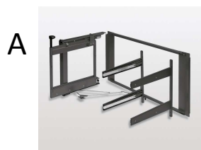
Left hand opening