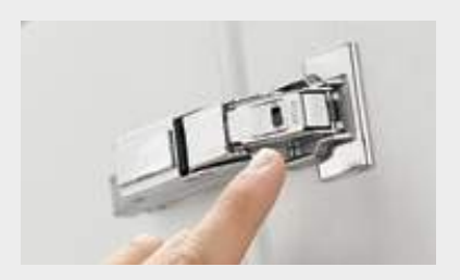
Switch for BLUMOTION deactivation