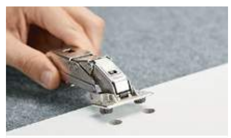
Place the dowels into the drilled holes