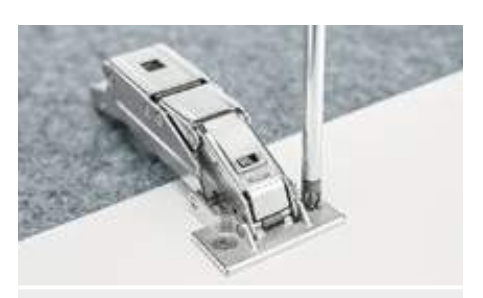
Tighten screws and it's done