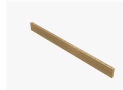
Cutttable bar of 8' 535810150 Holes increments of 1 " 535815150 Holes increments of 1 1/2 " Sold by unit