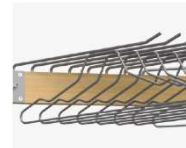
53510100 Hangers Holds 3 pieces of clothes each. Sold in box of 50