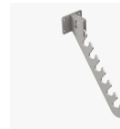
53521100 Side jagged support of 12 " 53522100 Side jagged support of 14 " 53523100 Side hooked support 14 " 53524100 Side support combined 14 " Sold by the unit