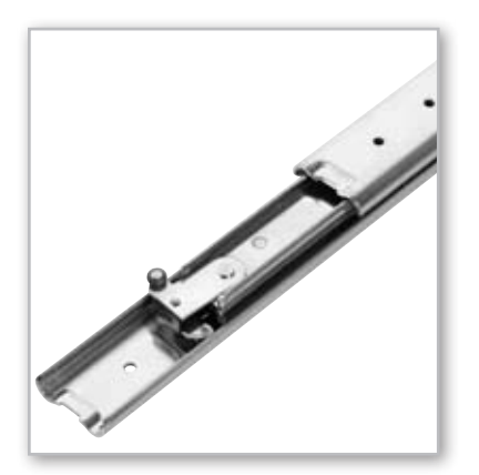
Detent and sequencing design ensures proper slide function