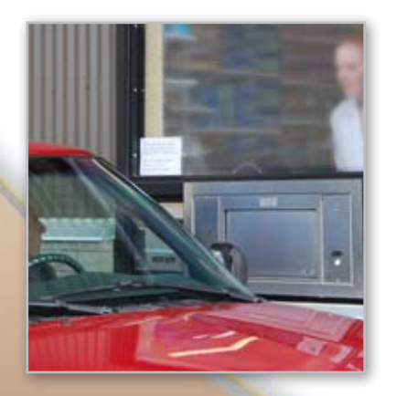
A good solution for partitioned indoor/outdoor access