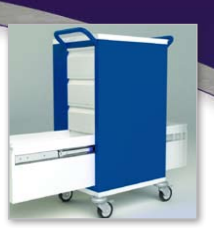
Expands access in mobile supply carts