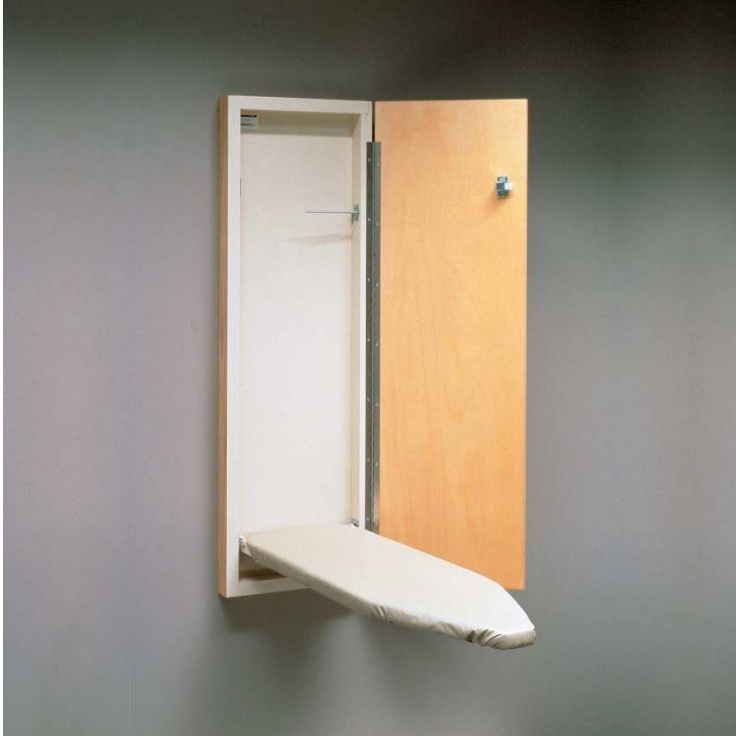
Surface mount installation ironing board.